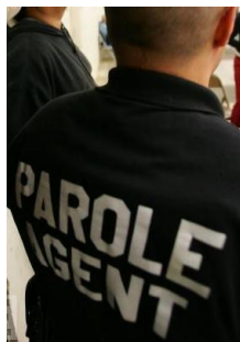
A typical Parole Officer Uniform

“P&P officers look just like other people. They can be men or women. They are like police officers except that they don’t wear uniforms. They have badges and sometimes they carry guns. A P&P officer might come to your home sometimes to make sure your family member is following the rules. If you are afraid or don’t feel safe with your family member, you can tell the P&P officer and (s)he will help you.”