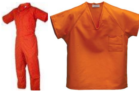
Examples of typical inmate clothing

“Inmates wear identical uniforms that look like doctor or nurse “scrubs.” They also have socks and shoes, provided by the prison.”