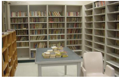
Picture of a typical library for inmates

“People read books, write letters, and go outside or to a gym for exercise. They attend classes that help them learn how to obey rules, be better parents, stop drinking alcohol or taking drugs, and be less angry. Most prisons have classes for inmates who want to earn their high school degree or study for college.”