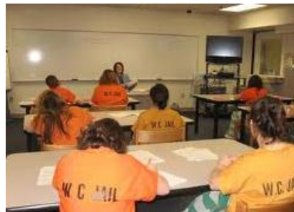
Picture of a classroom