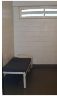
Picture of a typical prison cell

“Your family member will sleep in a bed sort of like a camp cot in a small room with bars on the door, called a cell. (S)he will probably share a cell with at least one other person, sometimes called a cellie.”