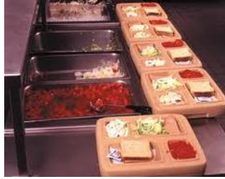
Example of food trays