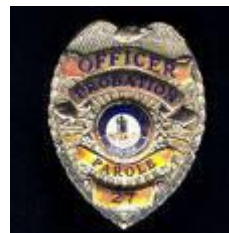
Probation Officer’s Badge