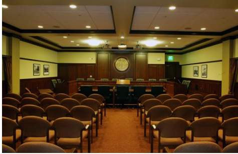
Picture of an Idaho Courtroom

(Cited: Idaho State Capitol Restoration http://huntconstructiongroup.com/landmarks/openings/idah-state-capitol/ )